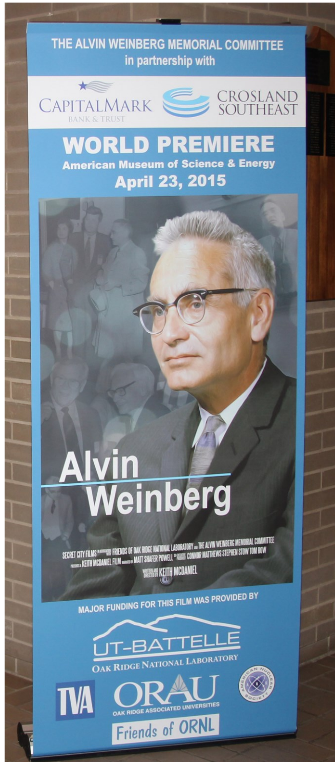
Alvin Weinberg documentary film poster

(As published in The Oak Ridger's Historically Speaking column on July 20, 2015)